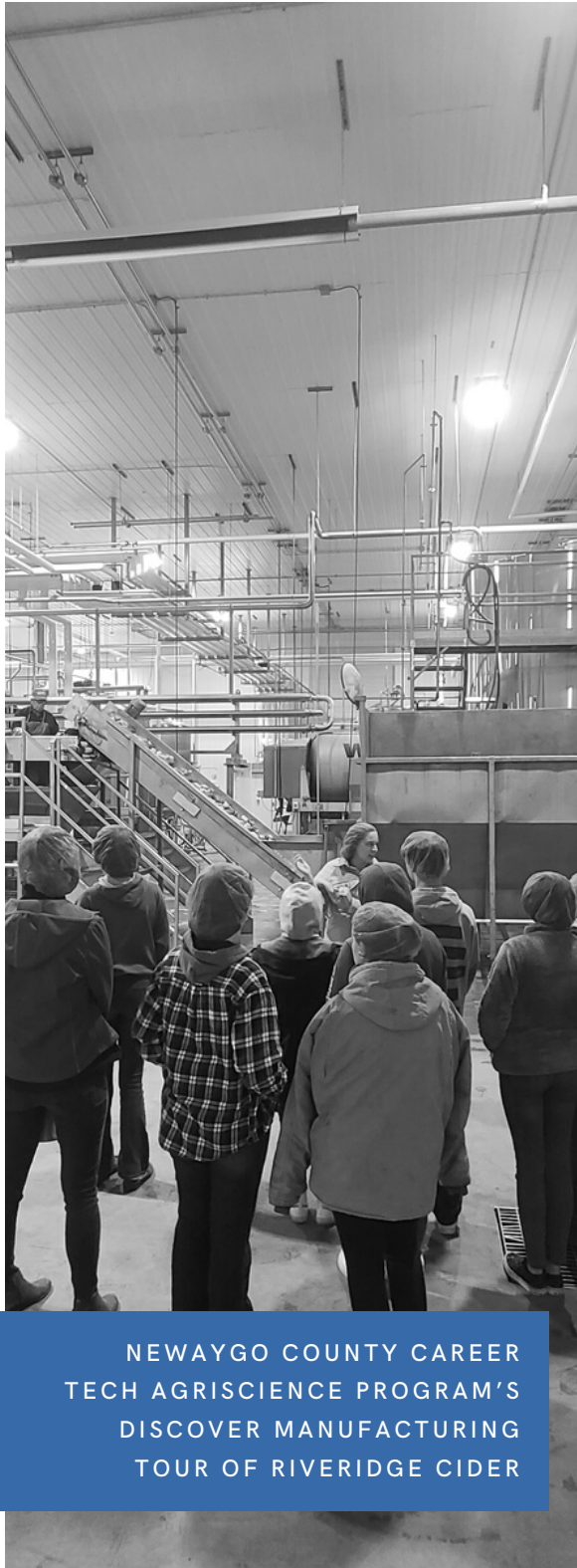
NEWAYGO COUNTY CAREER TECH AGRISCIENCE PROGRAM'S DISCOVER MANUFACTURING TOUR OF RIVERIDGE CIDER