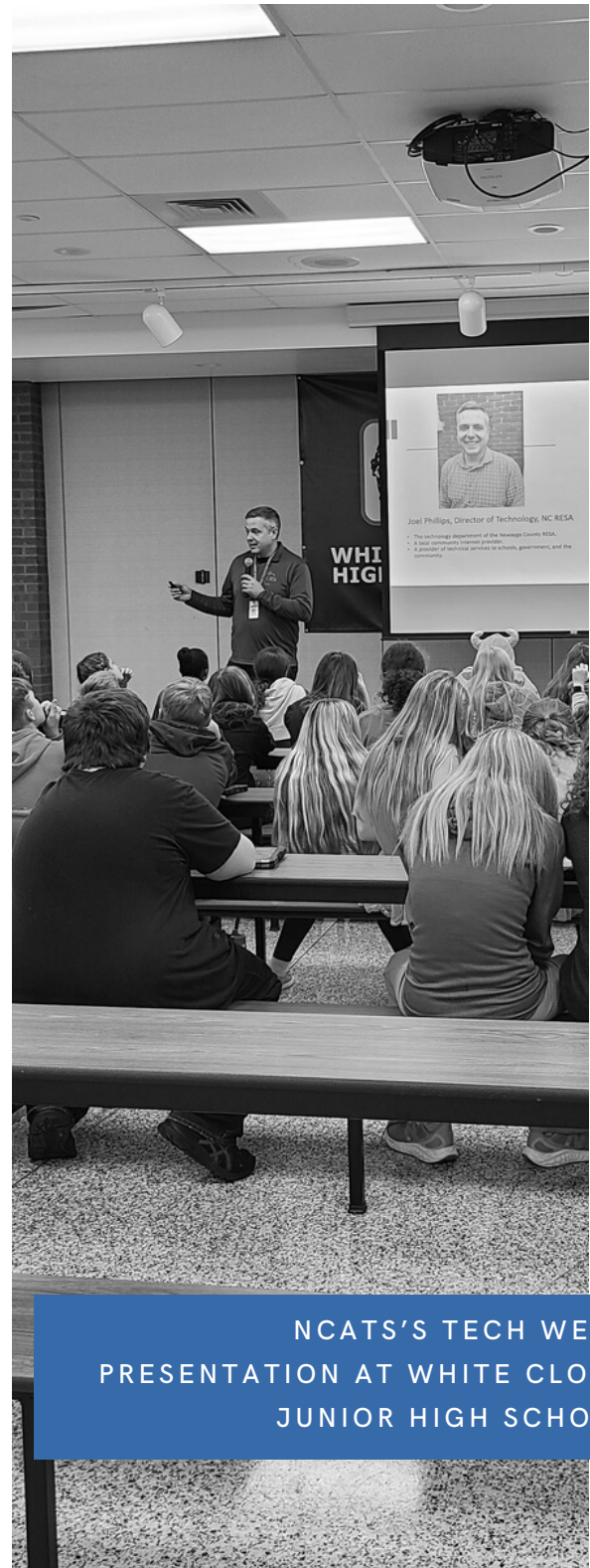
NCATS'S TECH WEEK PRESENTATION AT WHITE CLOUD JUNIOR HIGH SCHOOL

Including over $150,000 in training incentives, NCEDP's collaborations resulted in various companies receiving direct benefits worth over $300,000 in 2023.